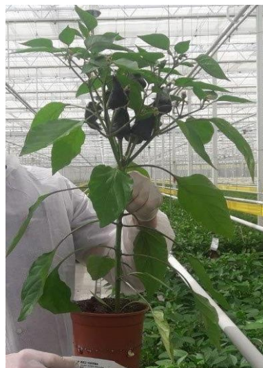
15 cm/6" pot with black fruits