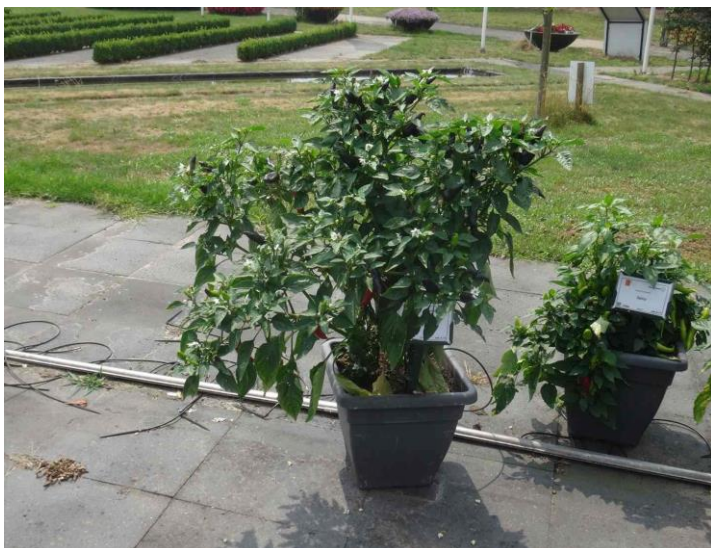
F1 Mamba Red Garden setting