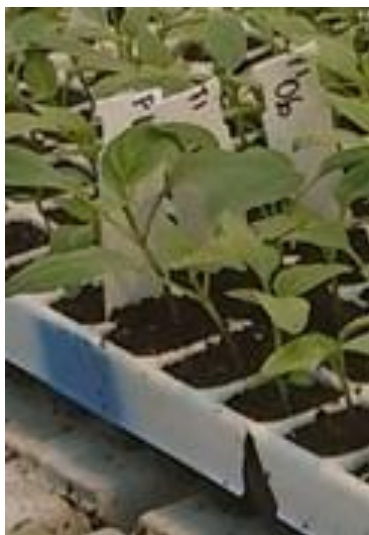
2,5 cm/1" plug